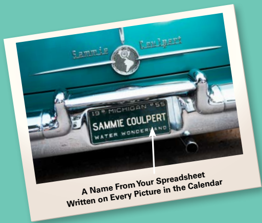
IMAGE PERSONALIZED CALENDARS